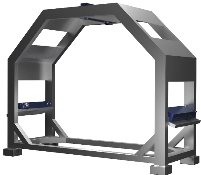
Toughness and stability due to many years of experience