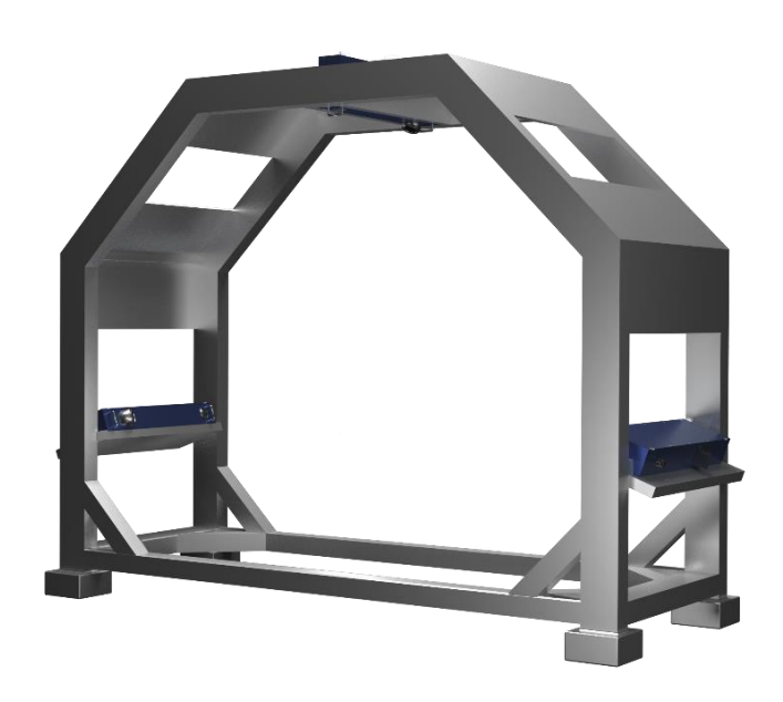
Toughness and stability due to many years of experience