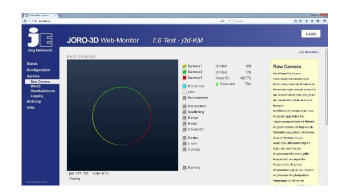
Full overview in the JORO Web-Monitor

The continuous recording of the complete surface allows an optimum measurement of ovality, taper, curvature and sweep, independent of the position of the log and the measuring position.